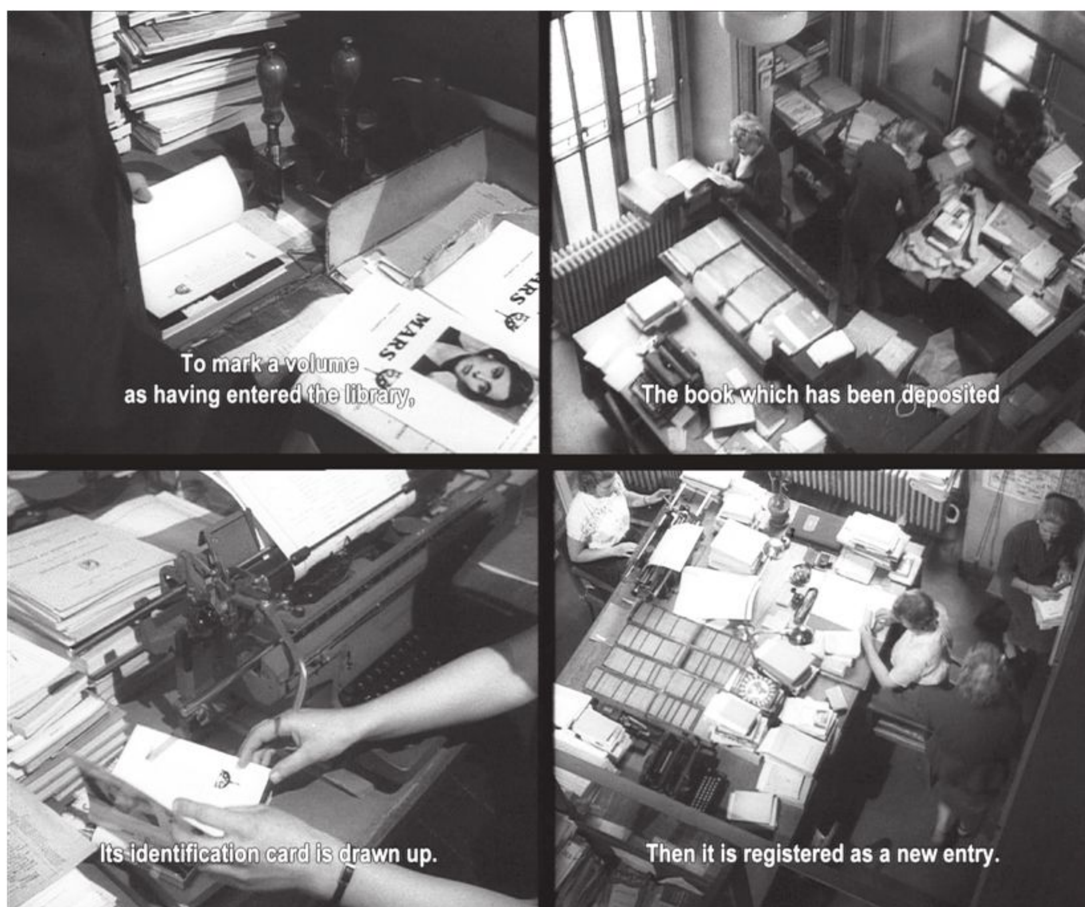
Figure 3, Alain Resnais (director), All the Memory of the World , 1956. Books as prisoners

of biblio-border control operates here, paper check for the books, which are given identification cards and those shelved on a cart readied for the reading room to have their request slips in them (figures 5 and 6).