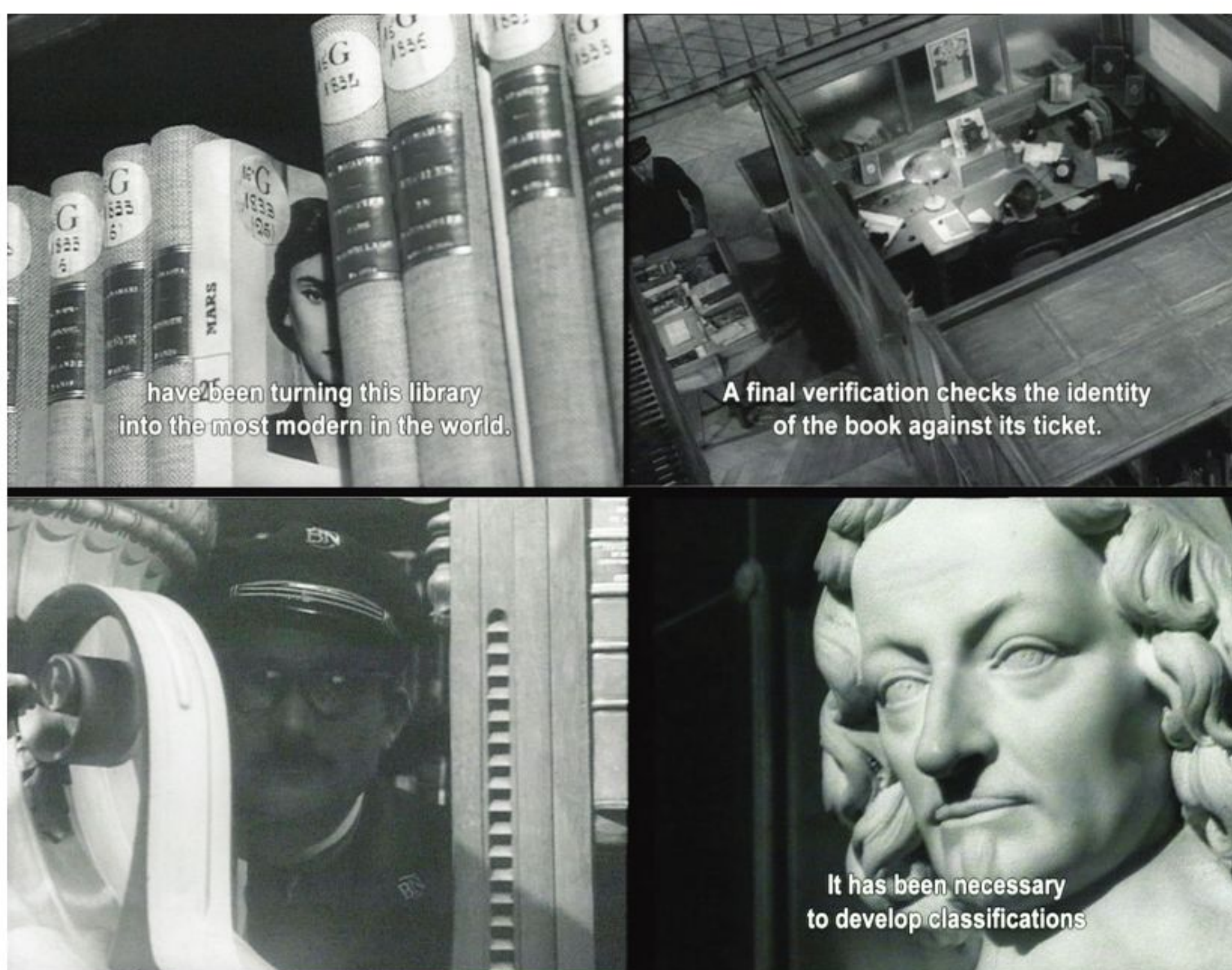
Figure 5, Alain Resnais (director), All the Memory of the World, 1956