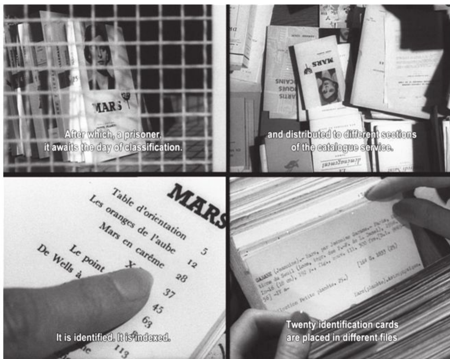
Figure 4, Alain Resnais (director), All the Memory of the World, 1956