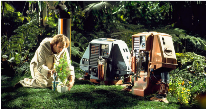
In the heart of the last remaining forest, botanist Freeman Lowell (Bruce Dern) instructs drones Dewey and Huey in planting techniques, in Douglas Trumbull's Silent Running (1972).

A key emphasis of the course is on learning how to see environmental elements of a film as more than scenery or allegorical doubles of (human) characters' emotions and actions: as real, determinant situations of subjectivity and agency – human and more-than-human – in the medium of film.