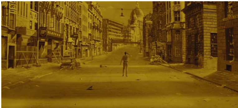
World-weary newspaperman Peter Stenning (Edward Judd) walks toward the uncertain future of abandoned London, in Val Guest's The Day the Earth Caught Fire (1961).