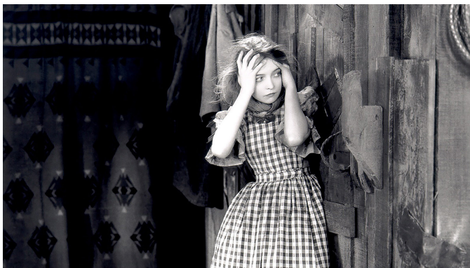
Letty Mason (Lillian Gish) listens in anguish to the sound of the rising wind, in Victor Sjöström's The Wind (1928).

Films discussed include a range of short experimental films from the twentieth and early twenty-first centuries, and Jean Epstein's The Fall of the House of Usher ( La Chute de la maison Usher , 1928), Victor Sjöström's The Wind (US, 1928), Joris Ivens's Rain ( Regen , Holland, 1929), Michael Powell and Emeric Pressburger's Black Narcissus (UK, 1947), Val Guest's The Day the Earth Caught Fire (UK, 1961), Hiroshi Teshigahara's Woman in the Dunes ( Sunna na Onna , Japan, 1964), Douglas Trumbull's Silent Running (US, 1972), Terrence Malick's Days of Heaven (US, 1978), Andrei Tarkovsky's Stalker (USSR, 1979), Hayao Miyazaki's Princess Mononoke ( Mononoke-hime , Japan,