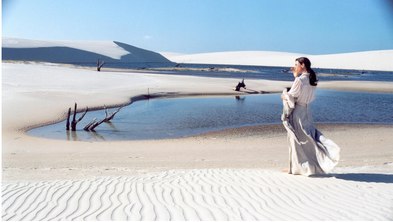
Áurea (Fernanda Torres) surveys the shifting horizon of the Lençóis Maranhenses, Brazil, in Andrucha Waddington's The House of Sand (2005).

Graded assignments include four short-form quick responses to assigned films and two long-form analyses of assigned films.