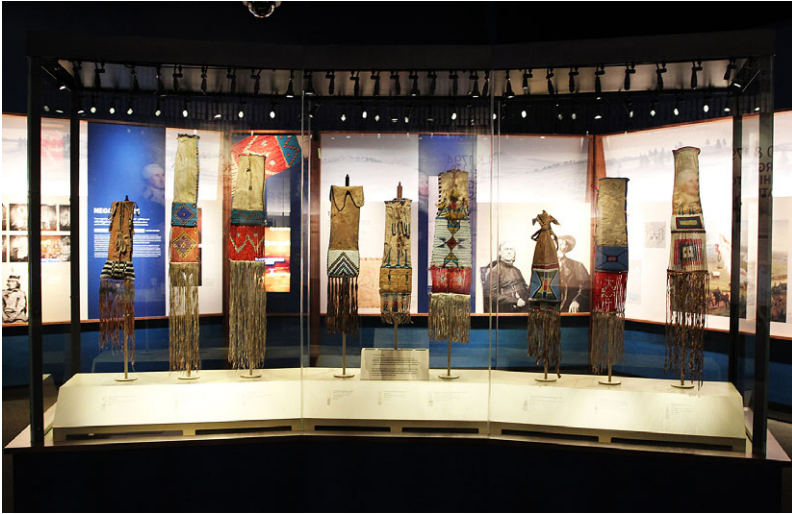
FIGURE 3. Nation to Nation exhibition at the National Museum of the American Indian. “The Great Smoke” case at the Nation to Nation exhibition.

congresswoman from New York, called detention centers for migrants “concentration camps.” The allusion to the Holocaust was clear. In response, the United States Holocaust Memorial Museum (USHMM), which opened in Washington, D.C. in 1993, released a formal statement rejecting “the efforts to create analogies between the Holocaust and other events, whether historical or contemporary.” 17 An open letter formulated among others by leading scholars in Holocaust Studies such as Omer Bartov, Doris Bergen, and Timothy Snyder, opposed the museum’s position. When the letter was published at the New York Review of Books , on 1 July 2019, it had more than two hundred signatories, many of whom have dedicated their careers to the study of Jewish and German history. By resisting analogies, the authors and signatories argued, the museum in fact turns the Holocaust into an ahistorical event. 18