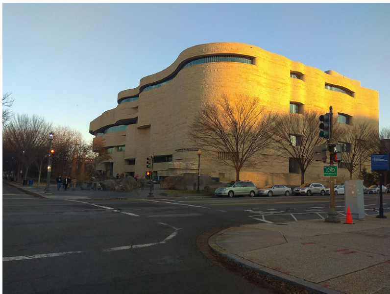
FIGURE 2. National Museum of the American Indian.

federal institutions located in their respective capital cities. Third, both are educational centers to a variety of target audiences, including tourists from abroad, school classes, as well as the source communities. Finally, both museums have to present the genocide and dispossession of the community they represent.