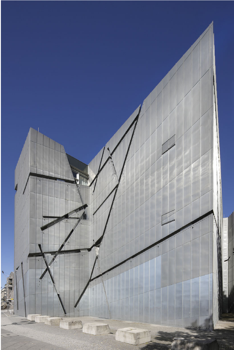
FIGURE 1. Jüdisches Museum Berlin.