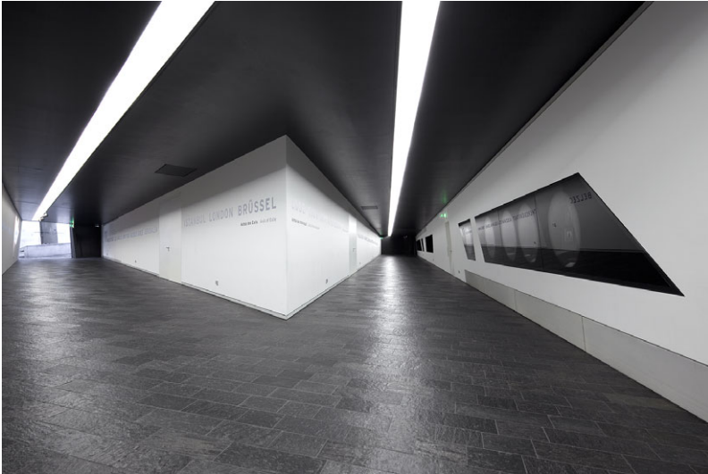
FIGURE 4. Jüdisches Museum Berlin.

set by Libeskind's imposing architecture. The historical presentation of Jewish life in Germany, the so-called "axis of continuity," begins on the second floor of the building, but most visitors approach it only after visiting the two other axes (figure 4). The axis of exile describes in objects and images the flight of Jews from Germany and leads to the disorienting outdoor Garden of Exile. The axis of the Holocaust contains individual objects telling tragic stories of loss and ends with the powerful experience of the "voided void" commonly known as the Holocaust tower. By the time the visitor climbs the stairs to the permanent exhibition on Jewish history, usually after about half an hour, they are already primed to think about the history of Jews in Germany in terms of destruction and loss. This not only frames the historical exhibition; it almost causes the visitors to forget, if they knew in the first place, that there is still a Jewish community in contemporary Germany. In both placement and curation, the postwar era appeared in the old core exhibition as an afterthought. In fact, one of the reasons for redoing the core exhibition was the desire to provide post-Holocaust Jewish life in Germany a much more prominent place, including through the presentation of objects and photographs collected and commissioned especially for this purpose. 34