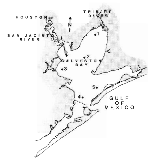
Fig. 1. Map of Galveston Bay, Texas, USA, with sampling sites

Sampling sites. Five sampling sites were chosen in Galveston Bay as representative of the range of water salinities and organic carbon contents of sediments in the bay (Fig. 1). Sites 1 and 2 are located in Trinity Bay which receives 70% of the freshwater inflow to Galveston Bay from the Trinity River (NOAA 1989). Salinities at these sites remained below 3% during 1993 (Table 1), a year of slightly less than average salinities (TWDB & TPWD 1992). Sites 3 and 4 were established along the highly industrialized western shore of Galveston Bay. Site 3 is located at the entrance to Clear Lake and near the mouth of the San Jacinto River, both of which receive the outflow of many water treatment facilities. Site 4 is located in a basin just offshore from Texas City where there is a concentration of petroleum refineries. Site 4, and Site 5 in East Bay, are most closely in contact with seawater inflow from the Gulf of Mexico although water at both sites remained below 20% salinity and only slight vertical stratification of the water column was observed throughout the study period.