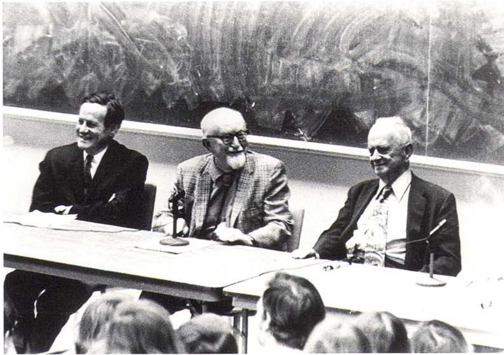
Fig. 7. Three of the architects of the evolutionary synthesis: G. Ledyard Stebbins, Jr., George Gaylord Simpson, and Theodosius Dobzhansky (Mayr is not pictured), photograph taken in the early 1970s

bridization and reticulate evolution, would have been at odds with animal evolutionists like Mayr.