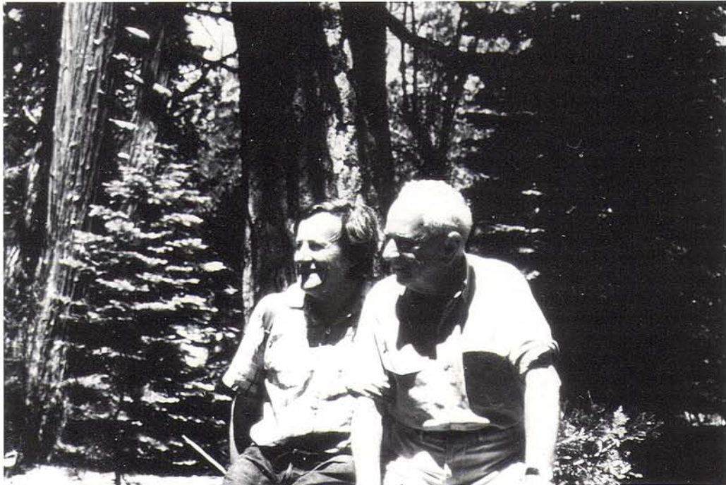
Fig. 6. G. Ledyard Stebbins, Jr. and Theodosius Dobzhansky at Mather, California. Photograph dated approximately 1965