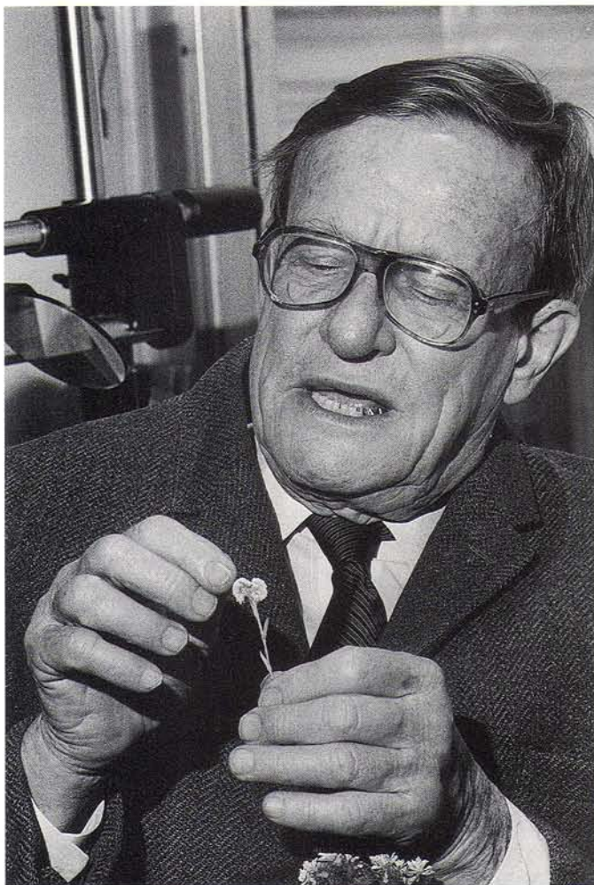
Fig. 1. George Ledyard Stebbins, Jr.

based on the distribution of glacial relicts), which presaged his life-long interest in phytogeography.