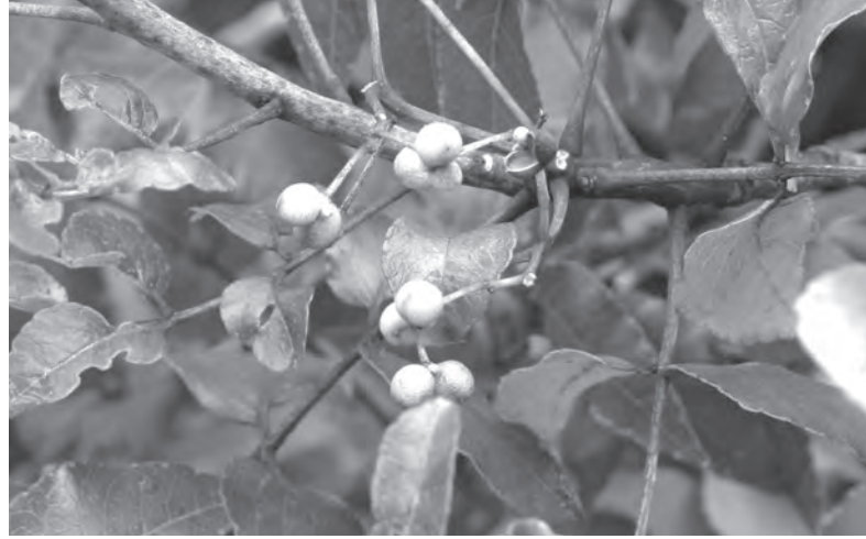
Above: Zanthoxylum clava-herculis