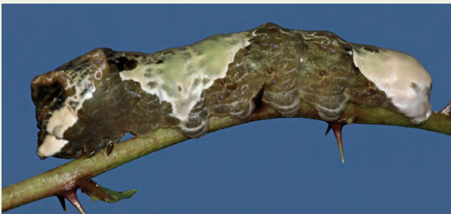
Far left: Zanthoxylum clava-herculis.