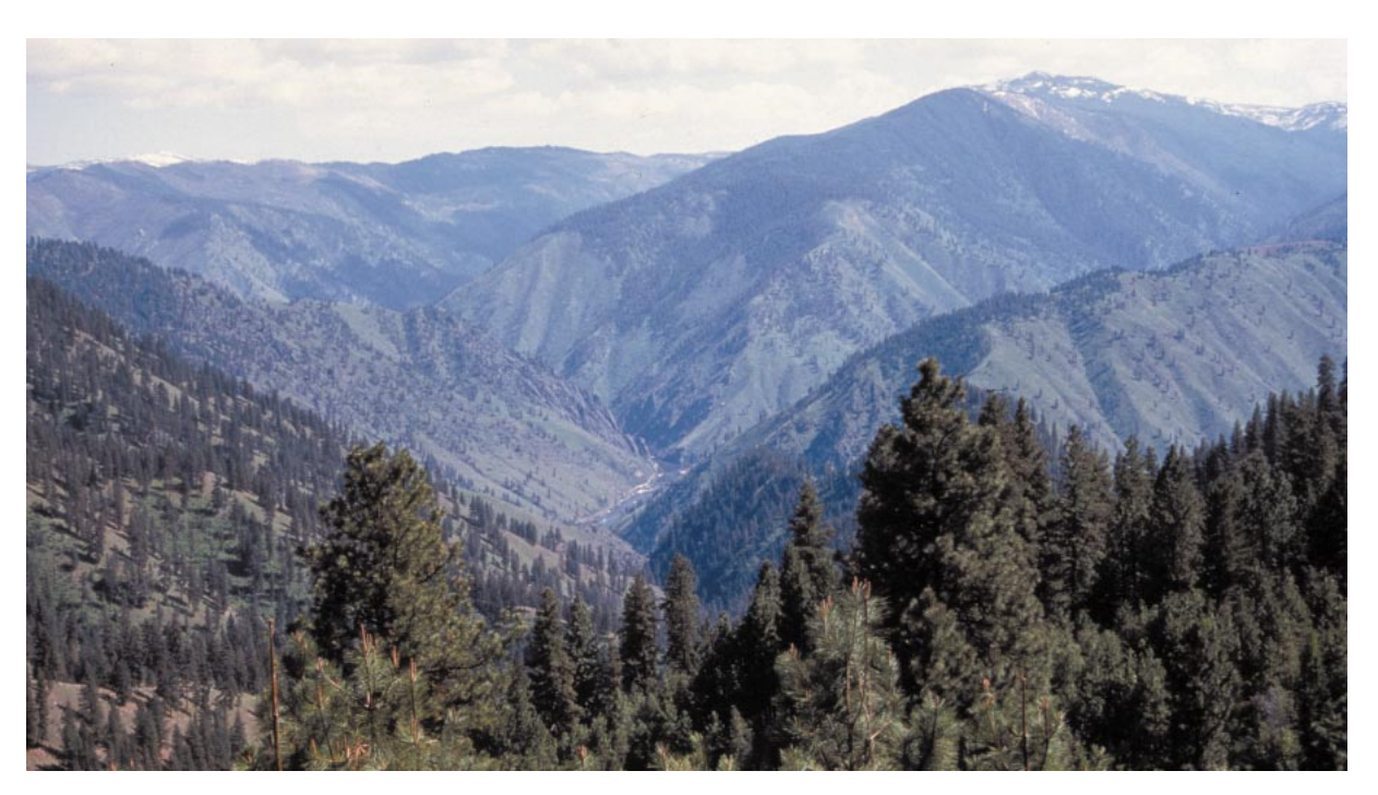
Figure 1. The Salmon River within the large wilderness core of Idaho. The few remaining relatively pristine landscapes worldwide will become increasingly important for testing hypotheses at the frontiers of ecology. These unfragmented landscapes are our only way of testing hypotheses on the dynamics and trajectories of ecosystem and evolutionary processes acting on extant species over long time scales and across broad geographic areas.

dynamics of ecological processes. Traditional definitions of species and traditional metrics of distribution and abundance often make a poor fit with the structure of microbial populations and communities.