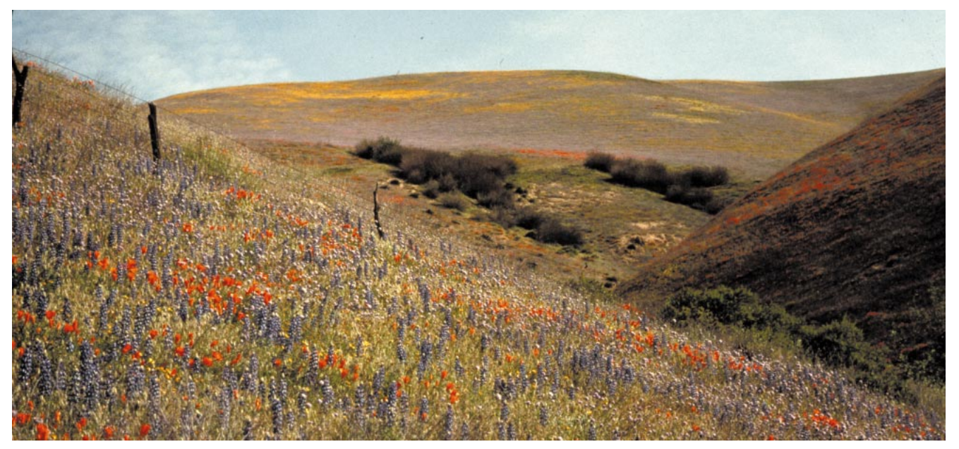
Figure 3. Coalescence of a new, complex plant community of native and introduced species at Tejon Pass, California. The community includes a mix of annual Mediterranean grass species and a diverse array of native annual wildflowers. Before invasion by the introduced grasses, the community was probably dominated by perennial, tussock-forming grasses, along with annual grasses and forbs.