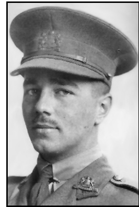
Wilfred Owen c.1916

In his last two years of formal education Owen was a pupil-teacher at the Wyle Cop school in Shrewsbury. In 1911, he passed the matriculation exam for the University of London but not with the first-class honors needed for a scholarship, which in his family's circumstances was the only way he could have afforded to attend. He was raised as an Anglican of the evangelical school, and in his youth was a devout believer, in part due to his strong relationship with his mother, which lasted throughout his life. In return for free lodging, and allegedly some tuition for the entrance exam, Owen worked as lay assistant to the Vicar of Dunsden near Reading. During this time he attended classes at University College, Reading (now the University of Reading), in botany and later, at the urging of the head of the English Department, took free lessons in Old English. His time spent at Dunsden parish led to disillusionment with the Church, both in its ceremony and its failure to provide