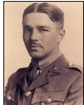
Owen