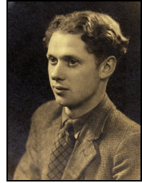
D. Thomas, late teens

published (of the 90 poems he eventually published, half were written during these early years). When “Light Breaks Where No Sun Shines” appeared in The Listener in 1934, it caught the attention of T. S. Eliot, Geoffrey Grigson, and Stephen Spender, and they published his first poetry volume, 18 Poems in December 1934. The volume was critically acclaimed, netting him new admirers from the London poetry world and causing excitement because of its visionary qualities and the strange violence of its imagery. In 1936, his next collection Twenty-five Poems , published by J. M. Dent, also received much critical praise. In all, he wrote half his poems while living in the family home, before moving to London, all the while developing a reputation for heavy drinking.