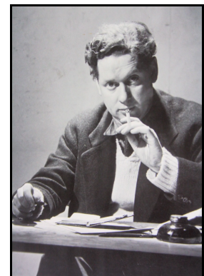
Dylan Thomas, c.1950

Thomas’s radio recordings for the BBC during the late 1940s brought him the attention of a greater public, and in 1950